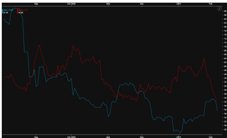
*From LiveVol Pro

Price Trigger: 100-Day Moving Average @ $86.39