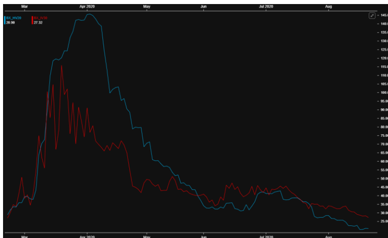
*From LiveVol Pro